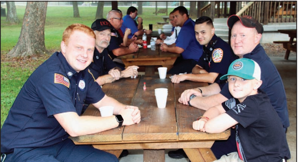
Allegheny Lodge No. 114 F&AM hosted its annual Big Breakfast to honor first responders in the county, holding the event at Meeks Park this year for social distancing.